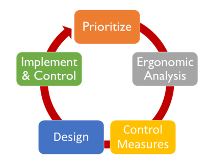
The IFA Ergonomic Process

Most Disabling Workplace Injuries in 2012